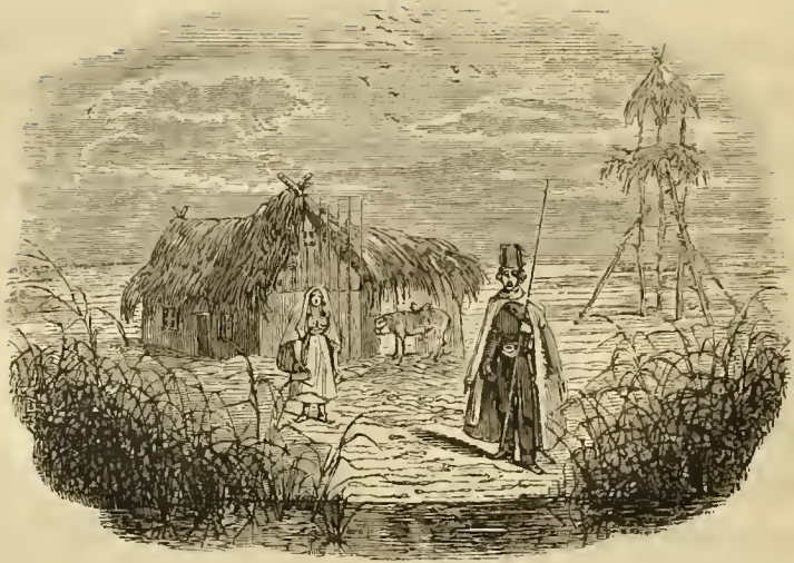
COSSACK GUARD-HOUSE AND WATCH-TOWER.